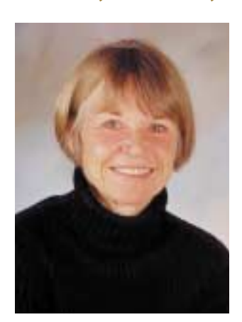
"Asthma affects all children, but minority children living in poverty are at the greatest risk."

A child goes to bed feeling well, then awakens during the night... crying for help and gasping for breath. This unexpected and frightening scenario is all too familiar for more than 5 million American families whose children suffer from asthma, the most common chronic illness of childhood.