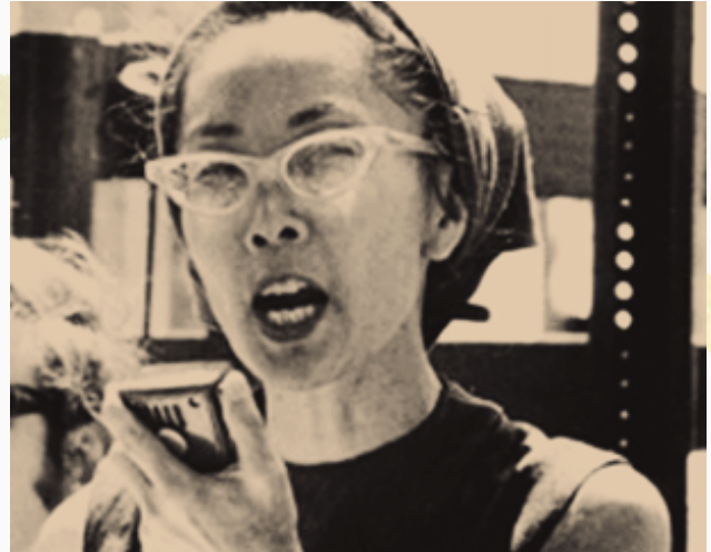
Yuri Kochiyama

During 2021, hate crimes fueled by anti-Asian racism and Sinophobia have escalated over 165% within major cities around the U.S., and have made a significant jump from 35 cases within the first three months of 2020, to more than 95 cases since January 2021, according to The Center for the Study of Hate and Extremism . Yet anti-Asian racism and hatred is unfortunately not a new phenomenon, and violence against Asian and Pacific Islander communities has been perpetrated for centuries in the U.S.