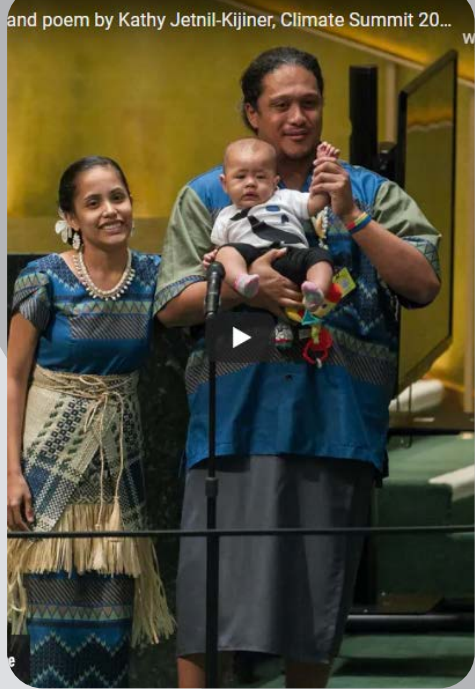
Dear Matafele Peinam , performed at the UN Climate Summit in 2014