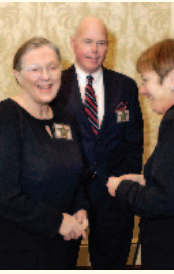
Students of the School's Accelerated Program greeted guests and helped with a Silent Auction.